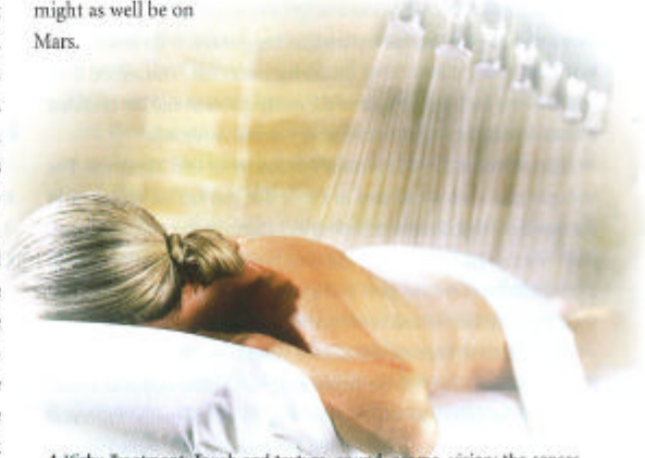
A Vichy Treatment. Touch and texture, sound, aroma, vision: the senses play the biggest part in the Stillwater experience. For the Torontonian, the spa is increasingly seen as a place to escape without the necessity of travel.

There are seventeen therapy rooms at Stillwater and the staff reaches seventy at peak hours. The most sought-after treatment might remain the classic Swedish massage, but people are increasingly demanding new and exotic routes to relaxation. The hour-long 'Mandarin Honey Body Glow' for example begins with a gentle exfoliation of the skin from head to toe. The therapists apply honey-infused mandarin juices, blended with sea salts. Then comes a total body Vichy treatment, an aqua-therapy that involves warm cascading showers. You lie down under this wet heaven, and turn over for equal opportunity to your front and back. The 'Mandarin' ends with a massage that uses a tangerine-scented cream. By this point the office might as well be on Mars.